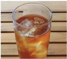
Iced Tea ¥500