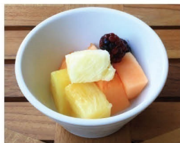
Seasonal Fruits ¥350