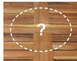
??? ??? ??? ¥???