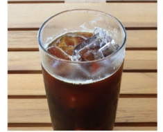
Iced Coffee ¥500