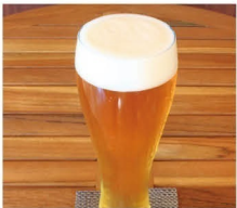
KIRIN Beer "ICHIBAN Permium" ¥750