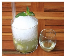
Lemon Mojito with shaved ice ¥800