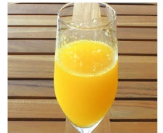
Sicilian Mimosa - Etna style- ¥800