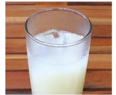
Grapefruit Juice ¥500