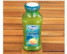
Yoga (Apricot / Pear) ¥700