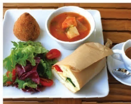
Arancino Lunch set ¥1080