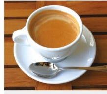
Caffe latte ¥550