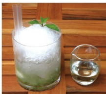
Mojito with shaved ice ¥800