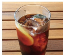
Averna back ¥800