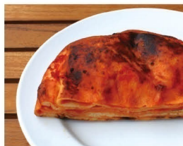
Focaccia Ragusana ¥420