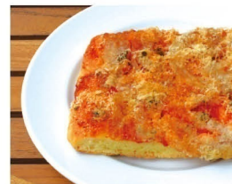
Sfincione (Pizza Palermo style) ¥380