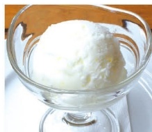
Gelato (Lemon / Fior di latte) ¥350