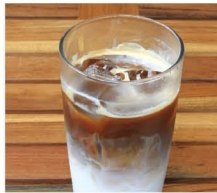
Iced Caffe Latte ¥600