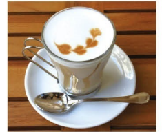
Latte macchiato ¥550