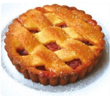
Crostata with seasonal Fruits ¥680