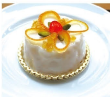
Cassata Siciliana ¥550