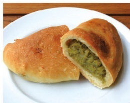
Scaccia (Broccoli, Potato & Pecorino Cheese) ¥420