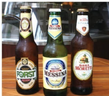
Sicilian and Italian Beers ¥700 / ¥700 / ¥750