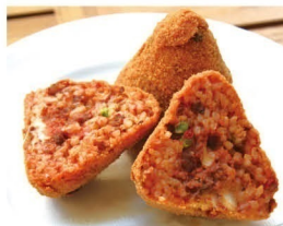
Ragout (Meat sauce) ¥420