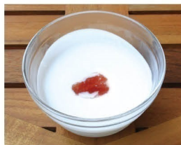
Yogurt with Sicilian Cactus Jam ¥300