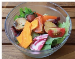
Seasonal vegetables salad ¥380