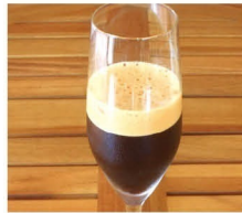
Caffe Shakerato ¥600