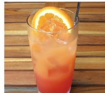
Sicilian Sunset ¥800