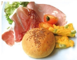
Set Breakfast ¥650