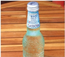
"Gassosa" Italian Classic Soda ¥700