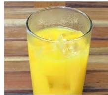
Sicilian Mandarin Orange Juice ¥600