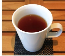
Black Tea (Earl Grey/Assam) ¥400