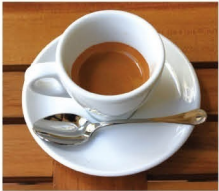
Espresso / Doppio (Double) ¥320 / ¥470