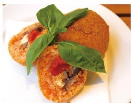
Eggplant & Ricotta Cheese ¥420