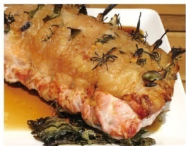
Roasted Pork ¥500