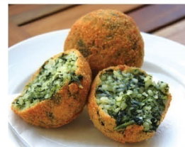
Spinach & Scamorza Cheese ¥380