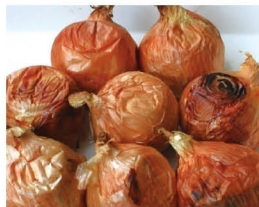
Roasted Onion with Sicilian Olive oil ¥300