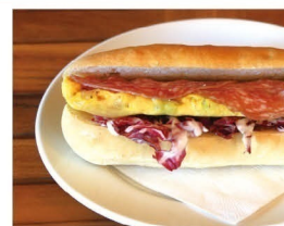
Panino with Omelette, Milano Samami & Treviso ¥550