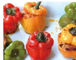
Roasted Bell pepper with Meat stuffing ¥800