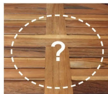
Unscheduled fun Original Sweets ¥???