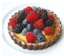
Crostata with mixed Berry ¥720