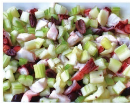
Marinated Octopus & Celery ¥700