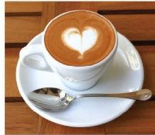
Caffe macchiato ¥380