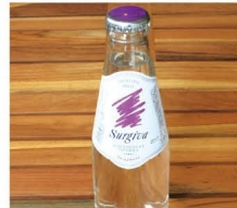
"Surgiva" Italian Sparkling Water ¥500