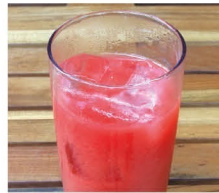
Sicilian Orange Juice ¥600