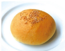
Sesame bread ¥80