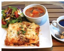
Lasagna Lunch set ¥1080