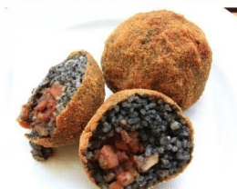
Squid ink ¥420