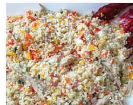
Homemade Tuna & Couscous Salad ¥800