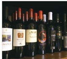
Sicilian Wines Glass ¥600~ / Bottle ¥3200~