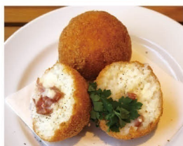
Bechamel & Mortadella Ham ¥380