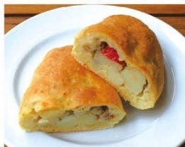
Scaccia (Stewed Lamb) ¥420