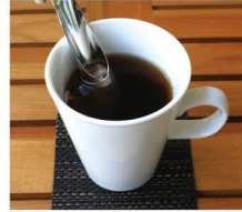
Caffe D'orzo (Barley Coffee) ¥400