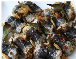
Beccafico (Oven baked sardin roll) ¥800