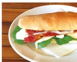
Panino with Prosciutto from Parma, semi dried Tomato, Mozzarella & Rucola ¥550