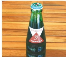
WILKINSON Ginger Ale ¥400