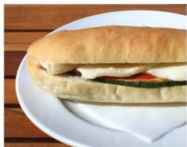
Panino with Grilled vegetables & smoked Provolone Cheese ¥550