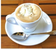
Caffe con Panna ¥400