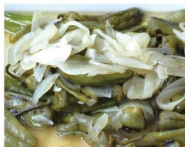
Bell pepper in Agrodolce ¥500