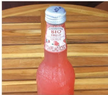
"Pompelmo Rosso" Grapefruit Soda ¥700